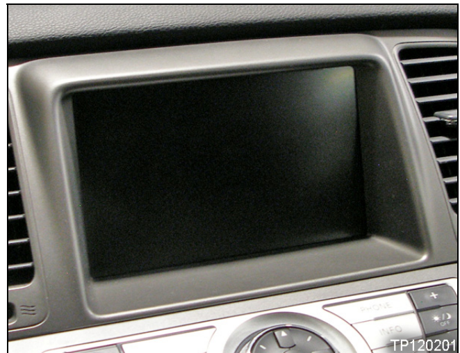
Display completely blank in DRIVE and reverse

NOTE: If the incident occurs only in REVERSE, further diagnosis may be required.